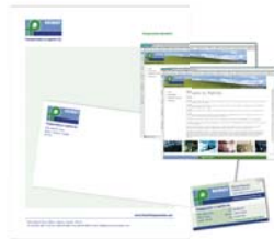
All Brand Pack