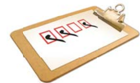
Custom Brand Pack