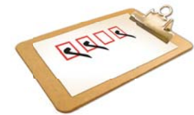
Custom Brand Pack