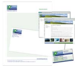
All Brand Pack