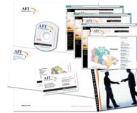
Ultimate Brand Pack