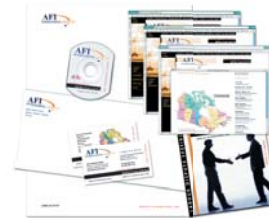
Ultimate Brand Pack